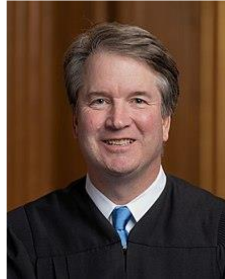
Justice Brett Kavanaugh -- 54