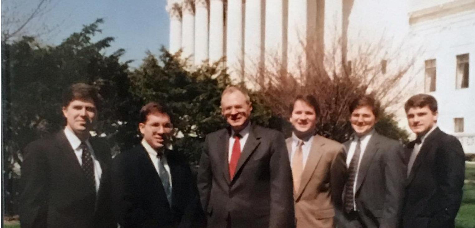
Neil M. Gorsuch (J. White, ret.)