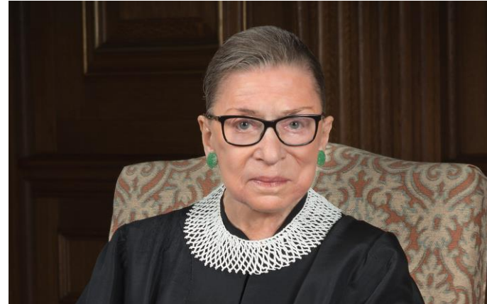
Justice Ginsburg? 86