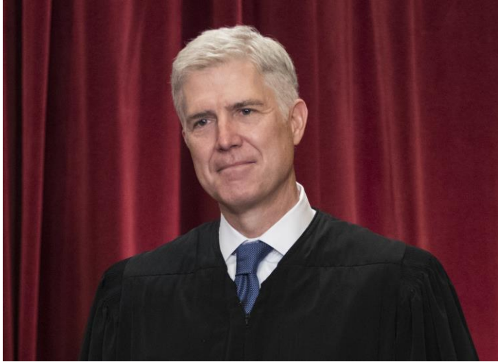
Justice Neil Gorsuch -- 51