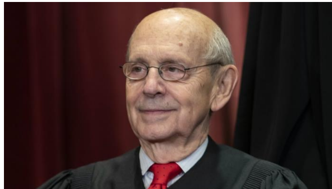
Justice Breyer? 80